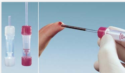
Microvette® 100/200 Blood collection with End-to-End capillary