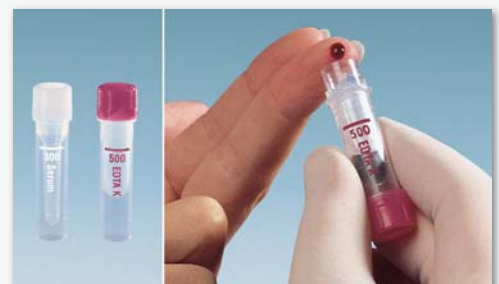
Microvette® 300/500 Blood collection with collection rim

More information is available on request.